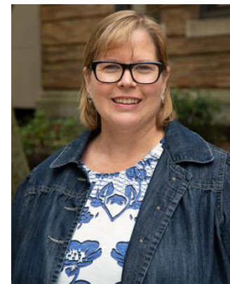
MELINDA GUSHWA SCHOOL OF SOCIAL WORK