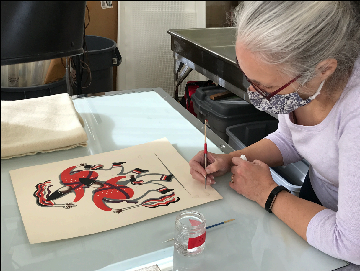
Dances of the Malinches Spot bleaching stains