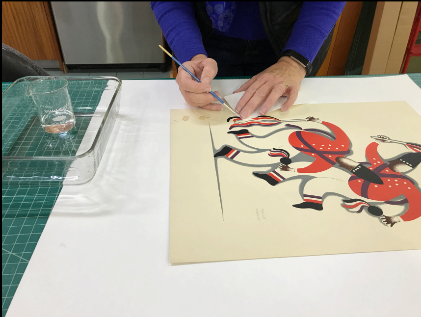
Solubility testing colors