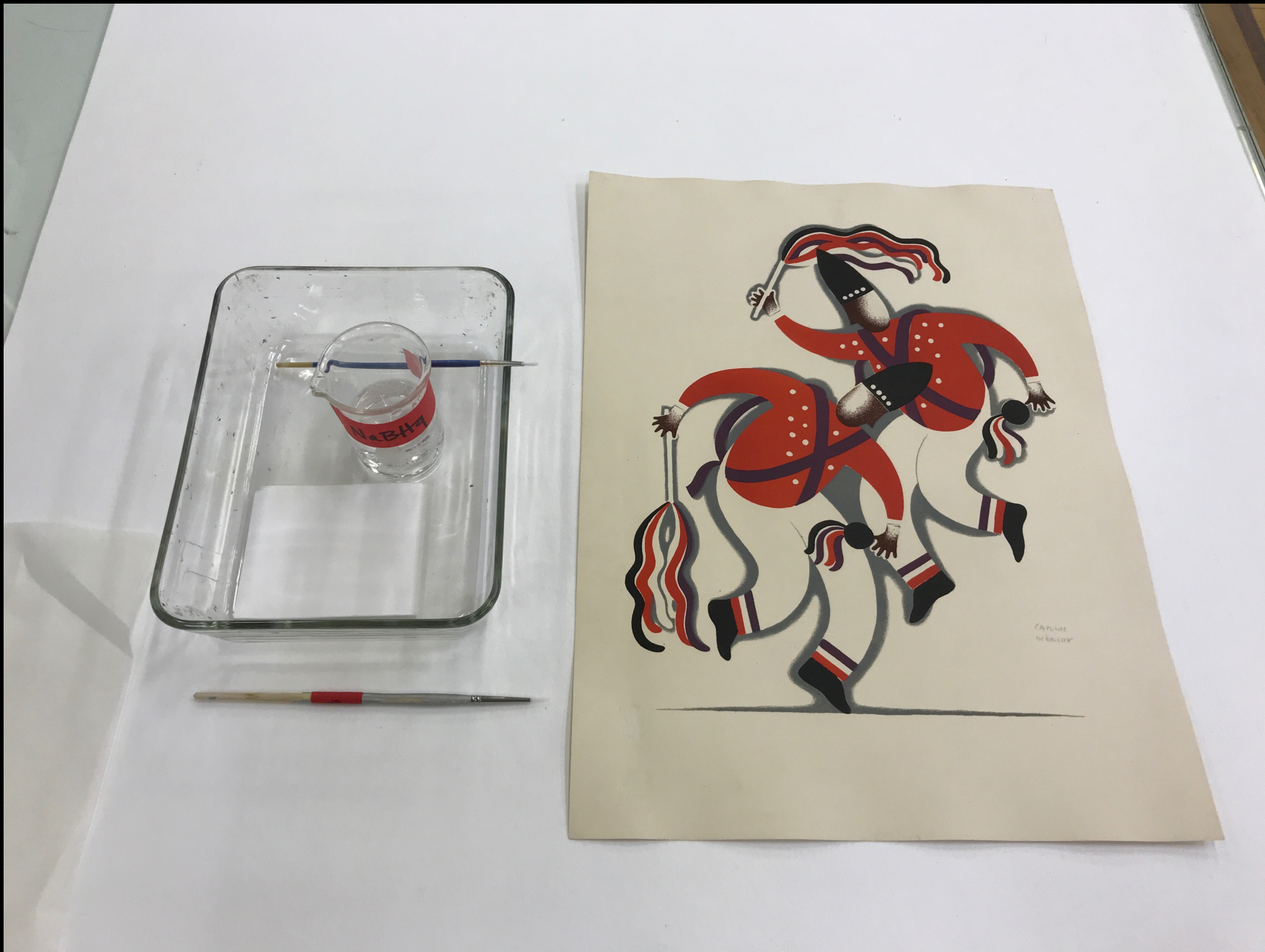
Dances of the Malinches Local bleaching