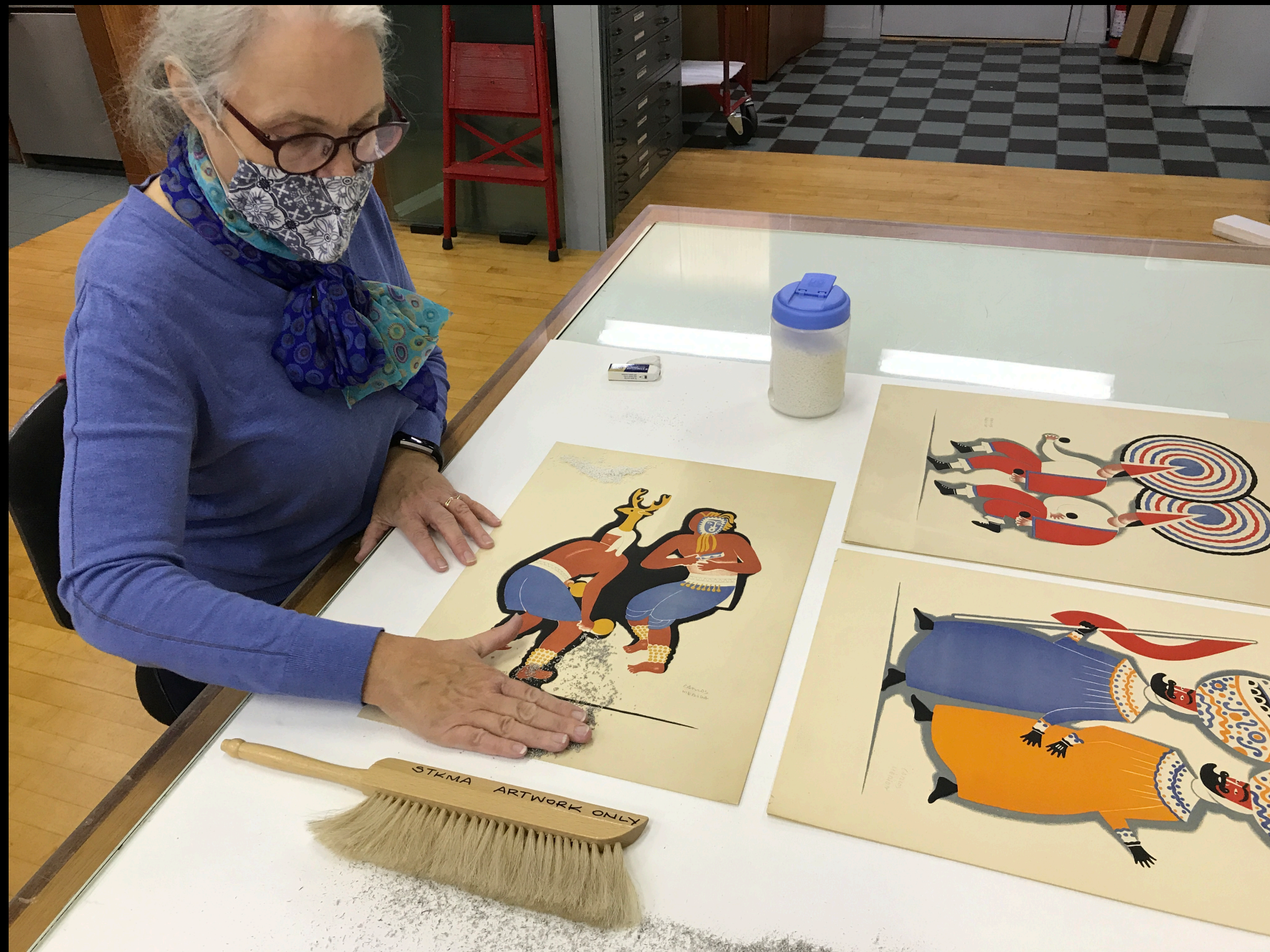
The Pascola and the Deer Surface cleaning – grated eraser