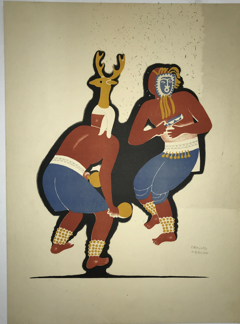
The Pascola and the Deer Surface cleaning during treatment