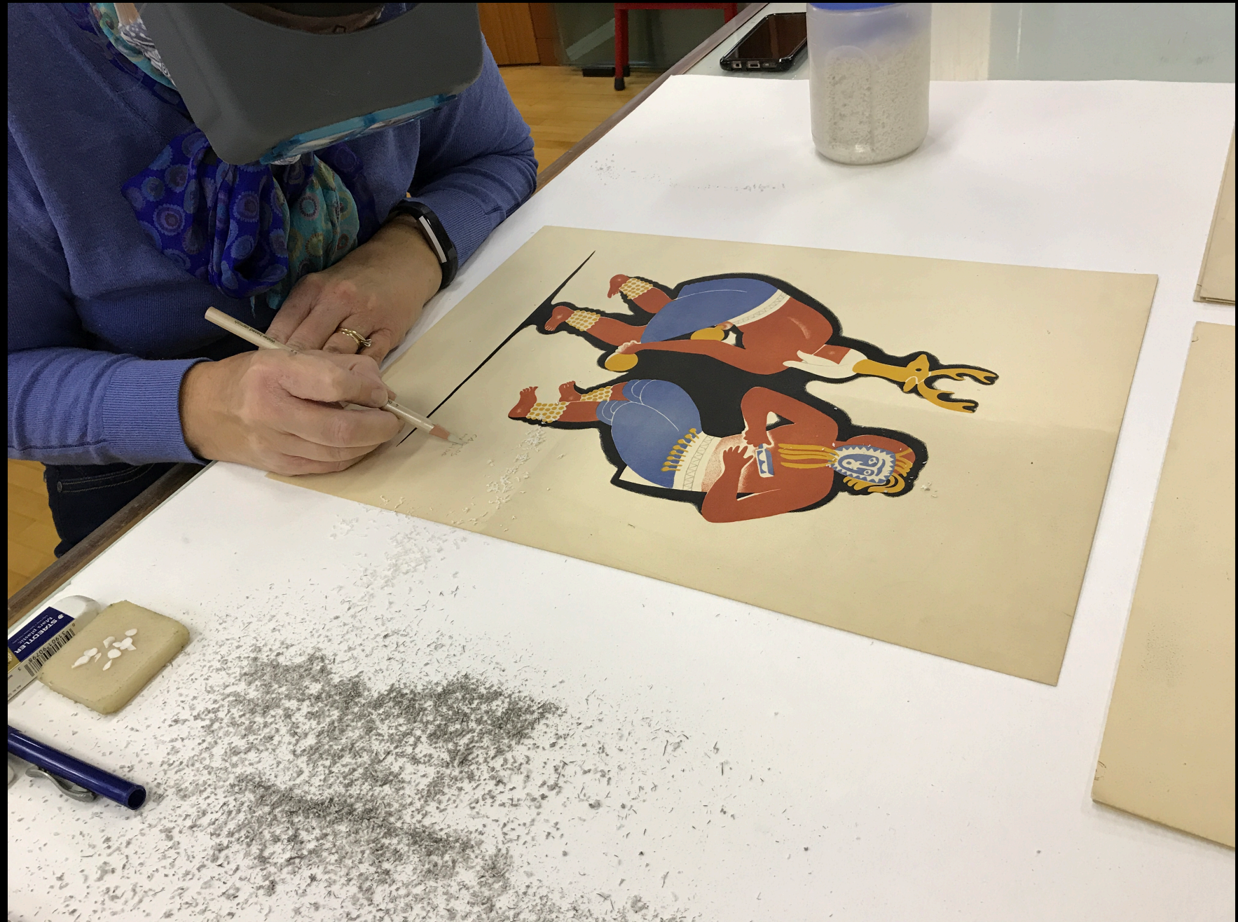
The Pascola and the Deer Surface cleaning around signature with pointed eraser pencil