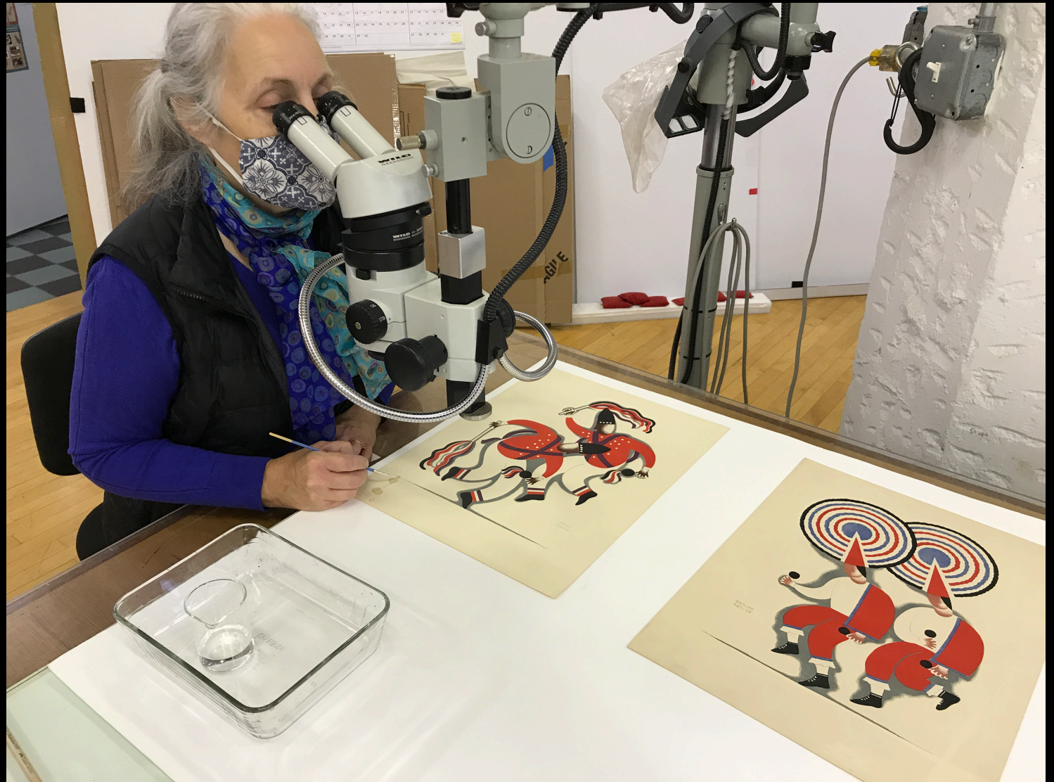
Solubility testing stains under microscope