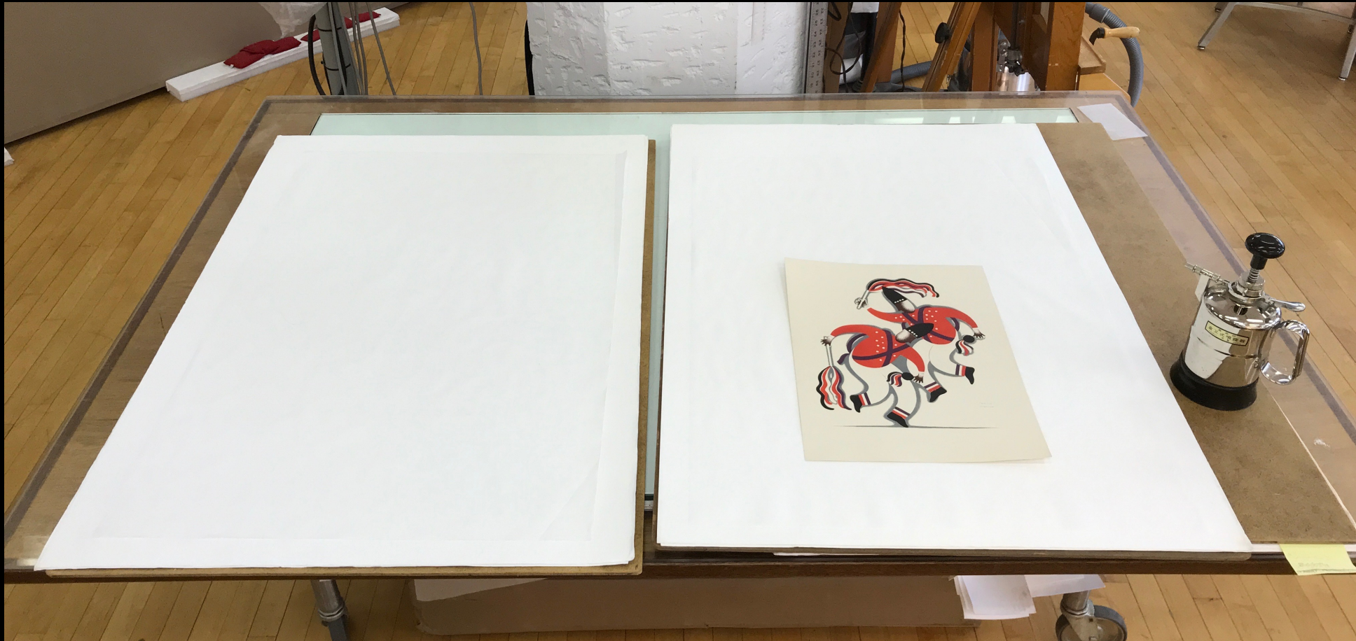
Dances of the Malinches Humidification and flattening between blotters in press