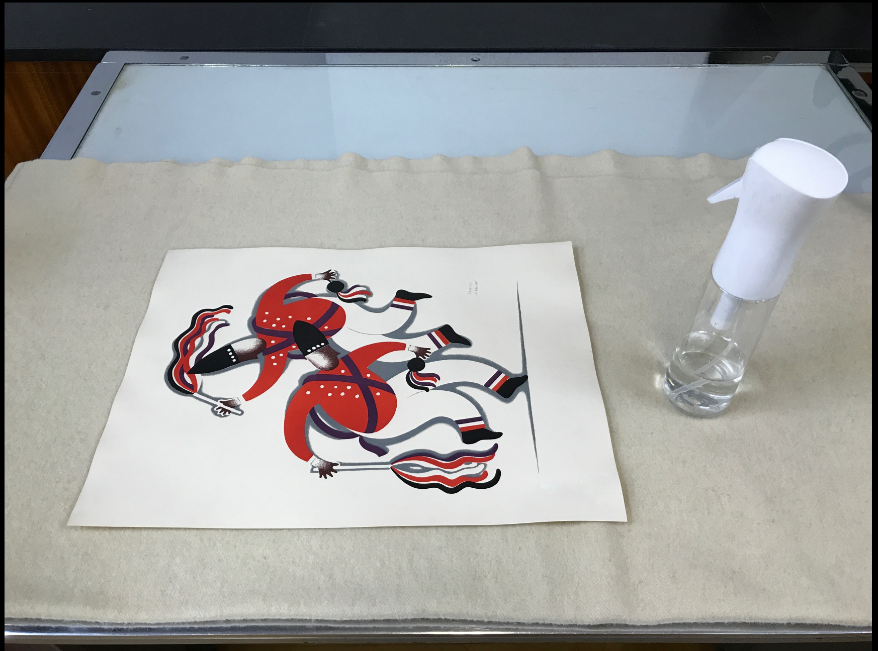
Dances of the Malinches Spraying up for washing