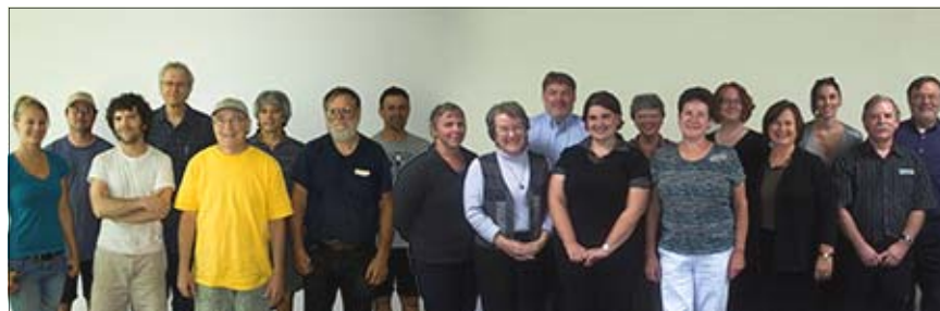
Staff of the Massachusetts Library System

The six regional library systems, Boston, Metrowest, Northeastern, Southeast, Central, and Western Mass., did the work the MLS is now doing. Like the MLS, each region was a non-profit. Each had about eight staff members, except for the Western Mass. Regional Library System, or WMRLS, which hired its own drivers rather than outsource them. The western Mass. library