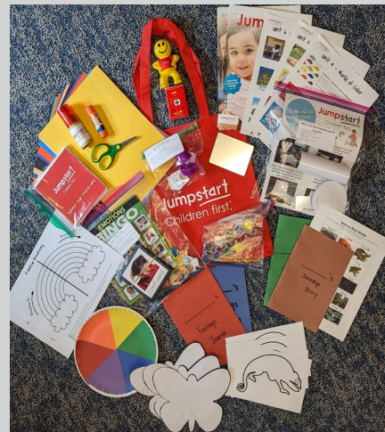
Units 4, 5, & 6