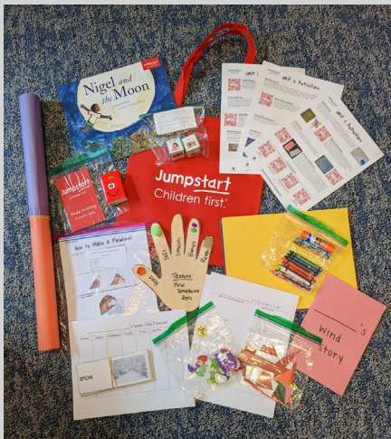
Units 1, 2, & 3