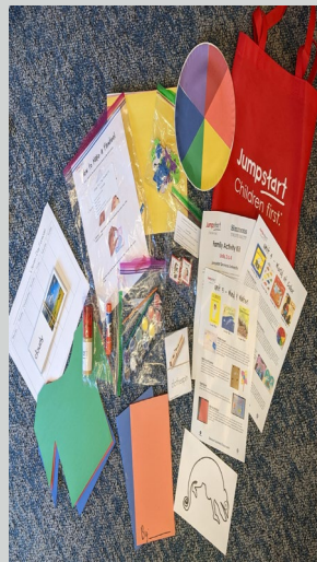
JPHS Units 3 & 4