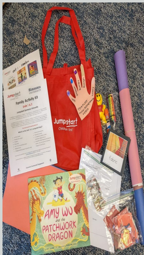
JPHS Units 1 & 2