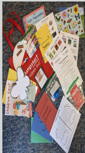
JPHS Units 5 & 6