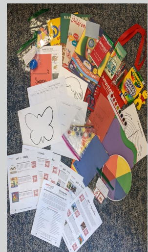
NLL Units 1-6